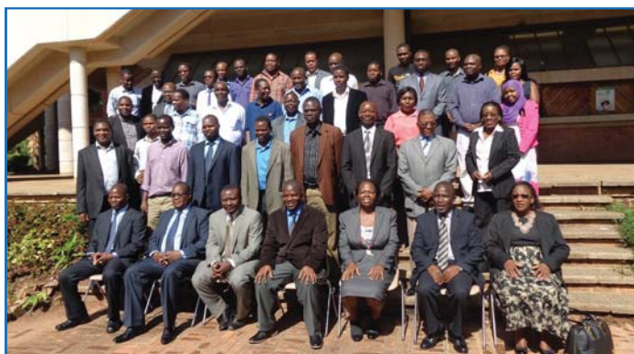
Participants of the Science curriculum review stakeholder workshop

representatives from ESCOM, ILLOVO, NICO Technologies, Ethanol Company, National Bank of Malawi, WM Chirwa & Associates, National Commission for Science and Technology, Makoka Research Station, Parks and Wildlife, Malawi Housing Cooperation, SNDP, National Statistical Office, among many.