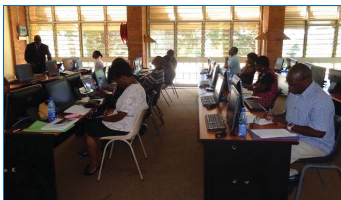
Participants at the CHAREC training workshop

policies, guidelines, functions of RECS vs research coordinating committees, functions of a secretariat of a REC, REC standard operating procedures, conflict of interest and its management by REC, vulnerable populations in research and many more.