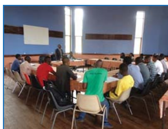
Leadership forum in progress in the Little

maintenance of college infrastructure, and classroom chairs. The leaders lamented the failure of some administrative officers to act on some crucial students' issues; however, the Vice Principal assured them of the open door policy in the management system where the students, through their leadership are free to come and consult management on any issues regarding their