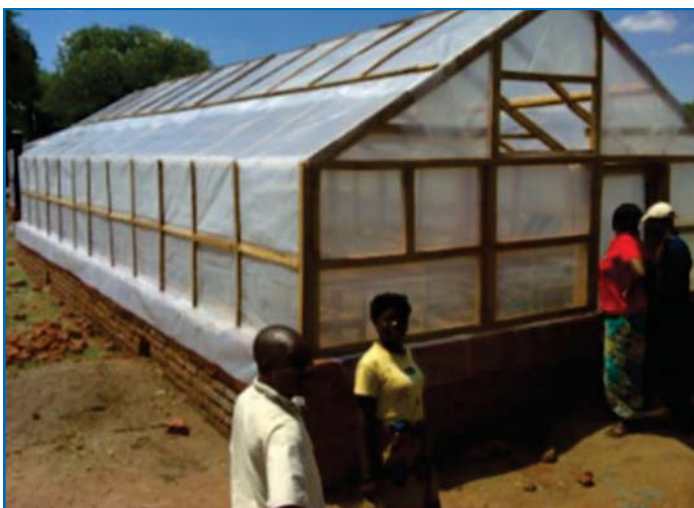
An model of the fish-drying tents to be used in the research project