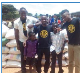
Leo Club students in Zomba

Chanco Leo Club, which is the campus branch of the Zomba Lions Club, was part of the effort to assist flood victims in Chamwali village in Zomba. The villagers have lost houses, property and lives in the heavy January rains. The club contributed firewood, maize flour, and beans.