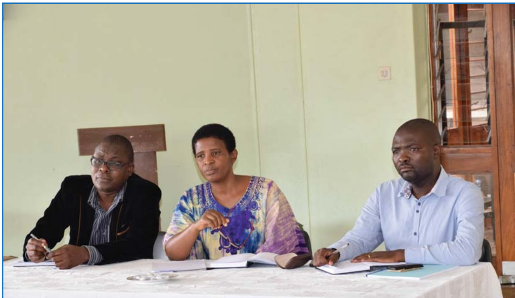
Staff from UNIMED addressing Chancellor College Staff.

run. For instance, members of staff bemoaned the way they had been denied services at various institutions without any notice from UNIMED.