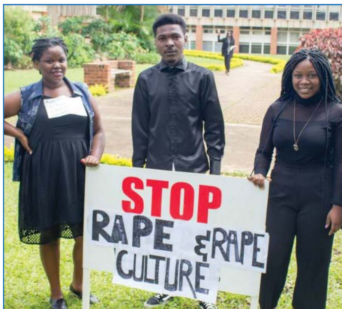
Students in solidarity against rape culture

Affairs directorate strived to investigate the existing attitudes on rape and issues of sexual consent that prevail in Chancellor College campus culture, and this was done through the formulation of scenario-based questionnaires.