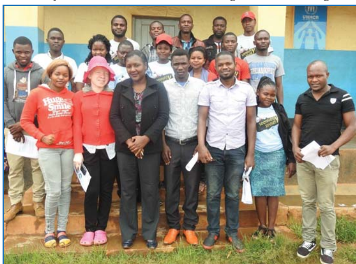
The students pose with the Director of the Camp

He concludes that it was a worthwhile experience to see how these people are assisted holistically by various non-governmental organizations such as UNHCR, Plan International and Jesuit Refugee Service. Before they left the camp, the Society donated exercise books, boxes of chalk and tablets of soap to assist school-going children.