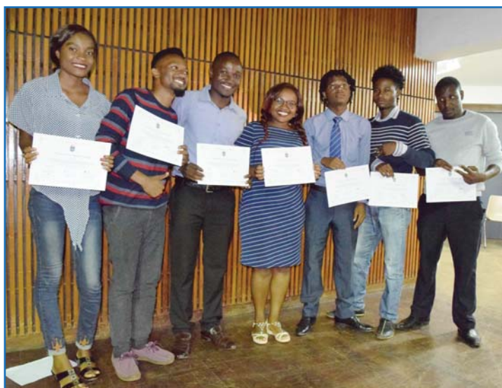
Some of the students on the Dean's List proudly display their certificates