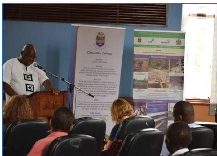
The Principal opens the workshop

reason, the Ecosystem-Based Adaptation for Food Security Assembly (EBAFoSA) Workshop, held on 18th January, 2018, was a timely event.