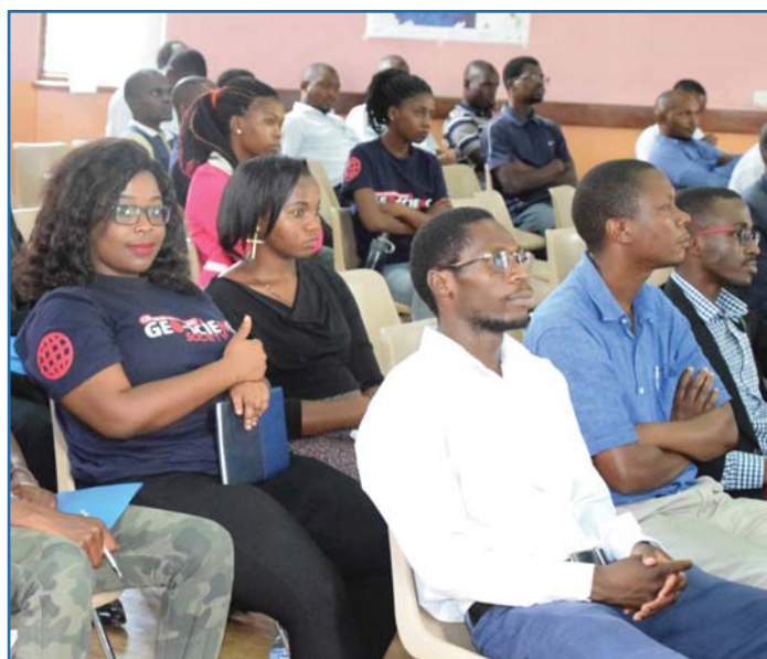
Participants at the GEMMAP conference

exploration and mining companies, GSD, The Polytechnic, Malawi University of Science and Technology (MUST), Press Corporation, International Geological Surveys and of course staff and students of Chancellor College.