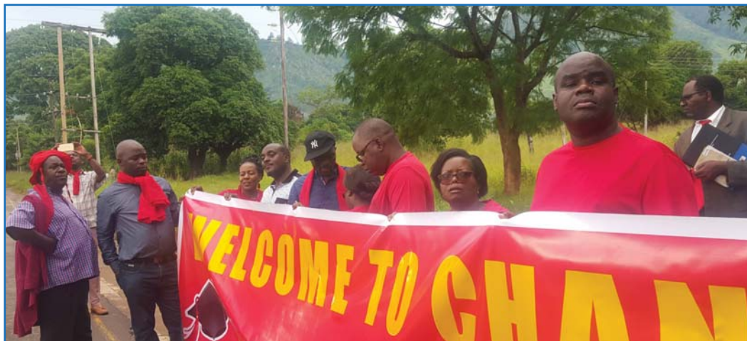
The Unionists proudly display the new banner

The Chancellor College Academic Staff Union (CCASU) on Friday, 16th February, 2018, held a function to commemorate the passing of seven years since the academic freedom saga. Exactly