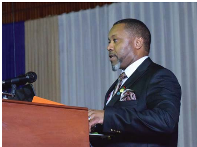
The Vice President delivers his lecture

people find themselves engaging in immorality due to lack of patience. He finished his presentation by referring back to his initial statement, "there is no right way of doing the wrong thing."