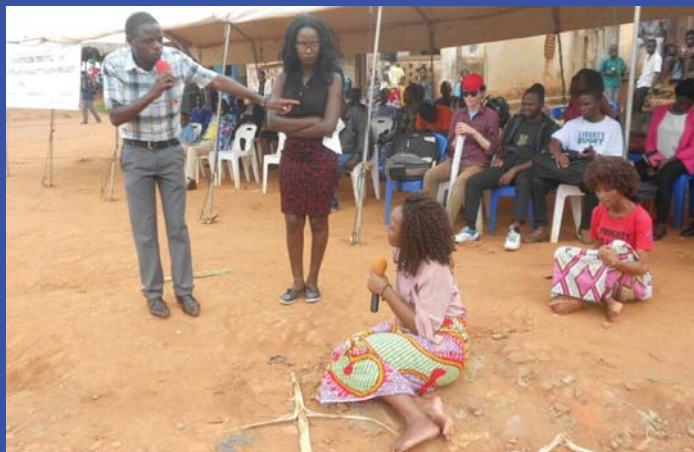
Students spread the message through drama

meaningful contributions to the development of the country.