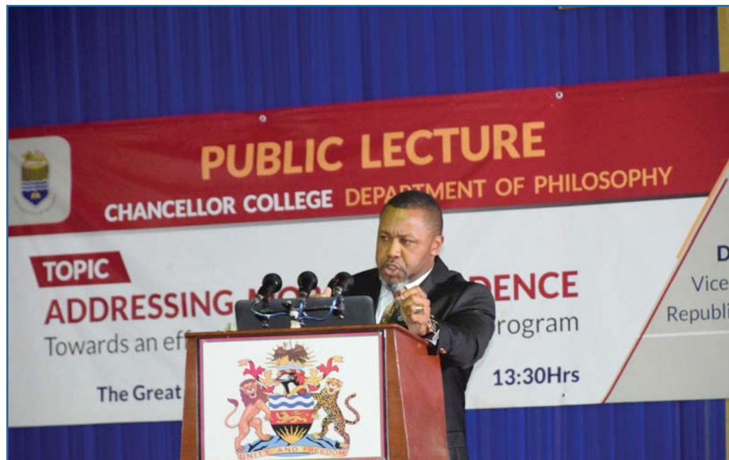
The Vice President of the Republic of Malawi, Dr Saulos Klaus Chilima, delivering a lecture in the Great Hall

Thanks to these instruments, we can look forward to the usual relaxation at the FPA, when the students perform mellow jazz tunes for free.