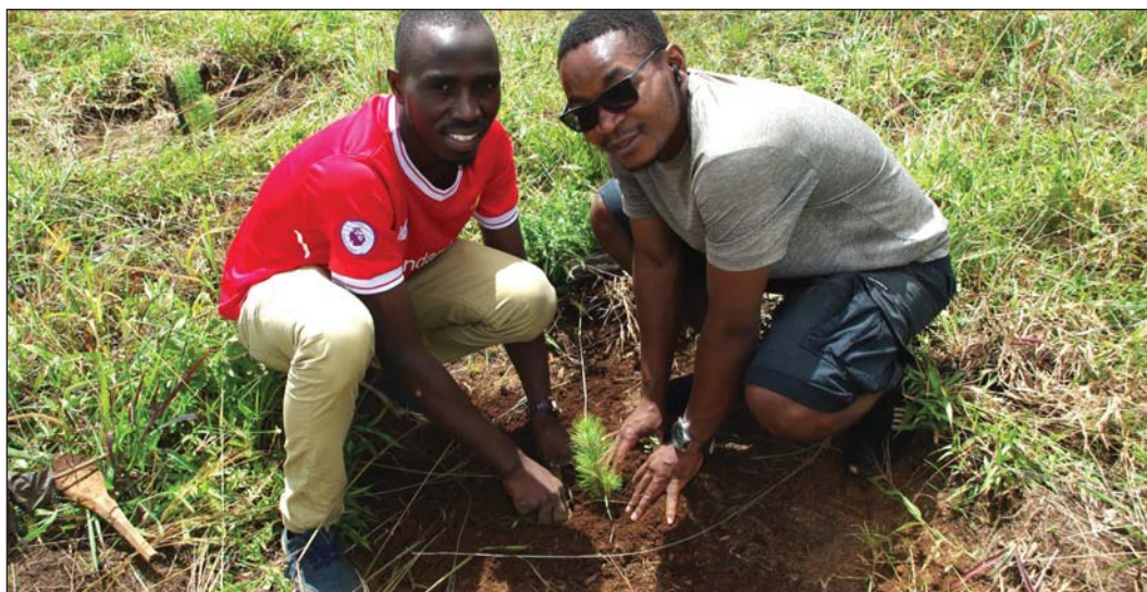
Students planting trees on Zomba Mountain

of Malawi. During the exercise, 3500 trees were planted over an area of 3.5 hectares. We thank the Chancellor College Management for the full support, as well as the Forestry Department for allocating the plot for the tree planting activity.