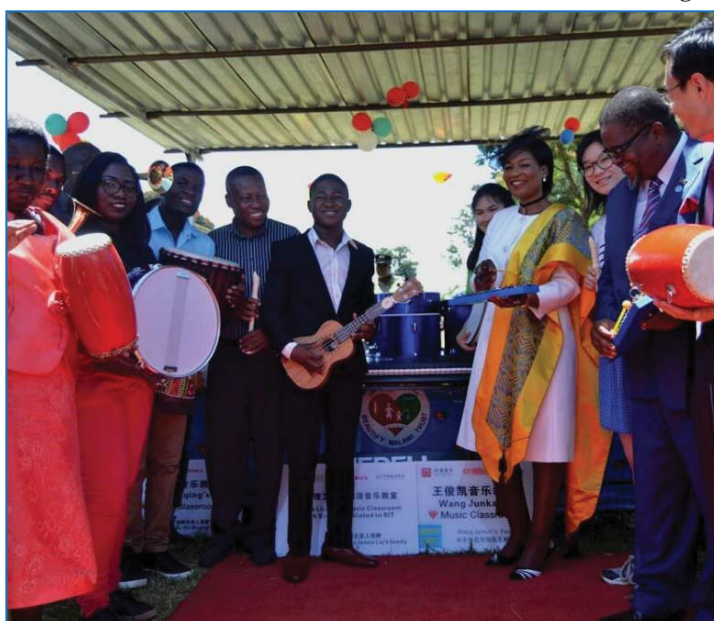
Chanco staff and students receiving the instruments

Gracing the occasion were the representatives from the Chancellor College, the recipient schools, BEAM Trust, Minister of Education Science and Technology, The Vice-President of the China Africa Business Council, His Excellency the Ambassador of the People's Republic of China to Malawi and three students representing the five students who had generously set aside their pocket money to buy the equipment.